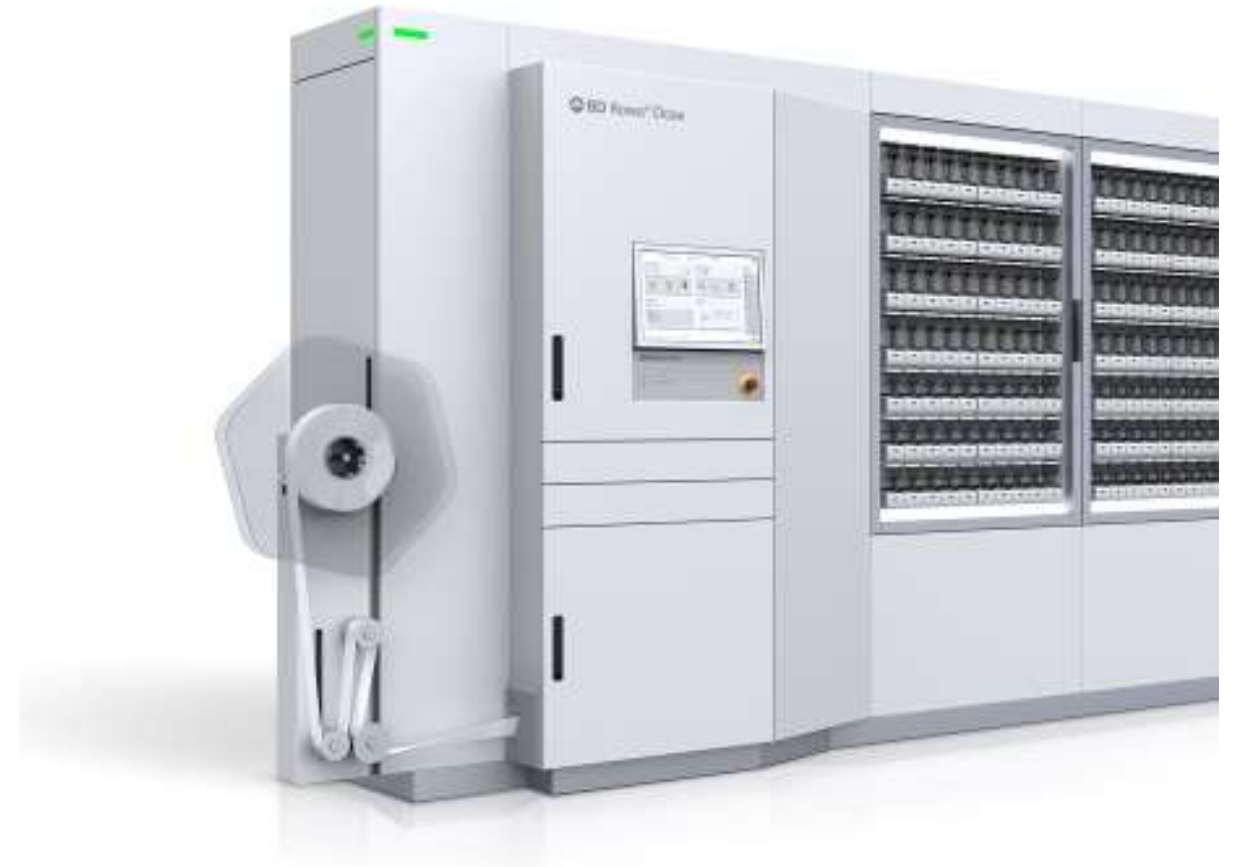
Patient-Specific Blister Packaging with Rowa™ Dose